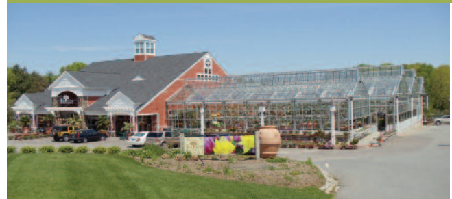
▼ Briggs Garden and Home, Attleboro, MA

Every Nexus structure is backed by our respected customer service program and more than 40 years of engineering experience.