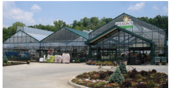
▲ Wilson Garden Center and Greenhouses, Newark, OH