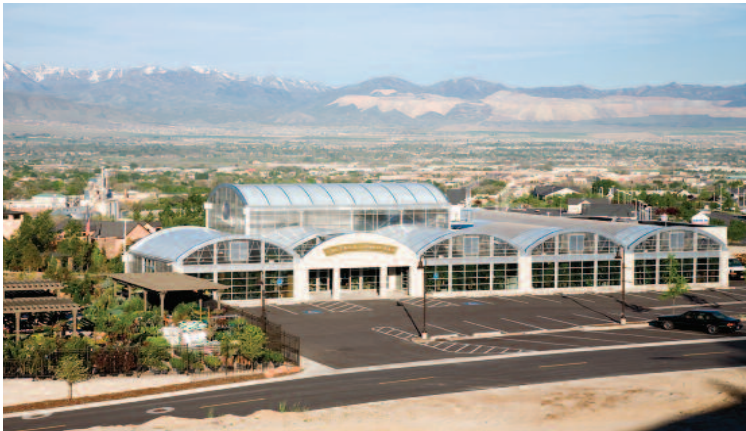
▲ Cactus and Tropicals, Draper, Utah