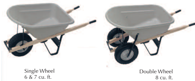
Single Wheel 6 & 7 cu. ft.

Pro Boss Wheelbarrows are professional grade for use by contractors on rough job sites. They have a structural steel channel undercarriage that will stand up to most demanding job sites. Its oversized 60" North American hardwood handles enable you to lift the heaviest of loads. Brentwood's UV stabilized polyethylene pan is extremely rugged and easy to clean, so it stays looking good job after job.